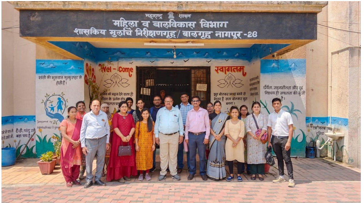
Seminar : Impact of Pandemic on Education and the Possible Solutions for school teachers