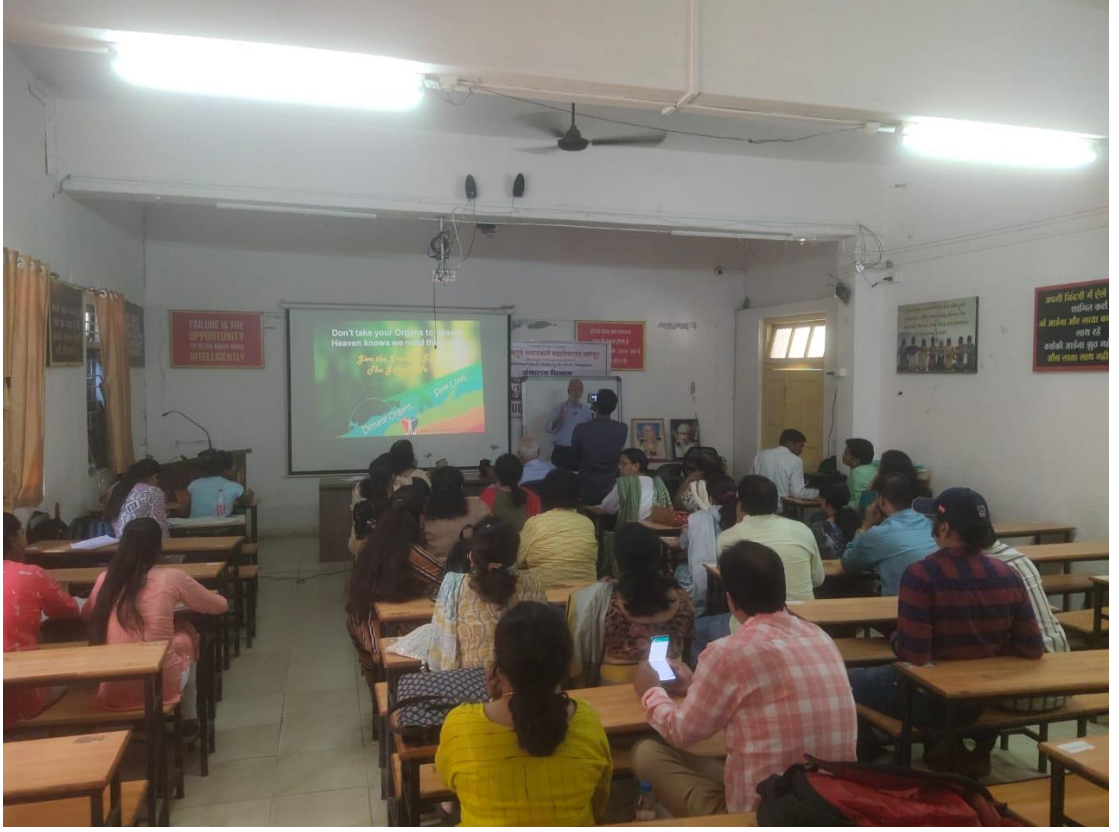
Participants attending the session