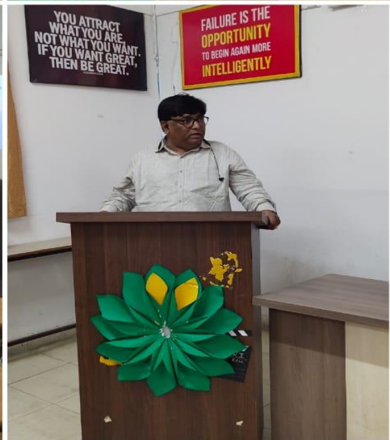
Resource Persons addressing the attendees during their respective session